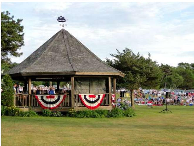
Brewster Band Concert

Small town band concerts are a part of Americana. Although these concerts are disappearing in many areas of the country, they remain a treasured and delightful part of the summer experience on Cape Cod.