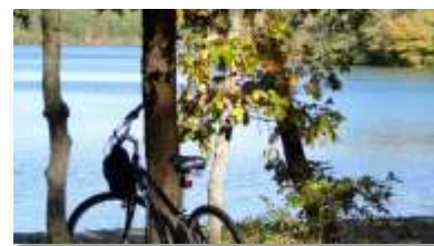
Cliff Pond – Nickerson State Park